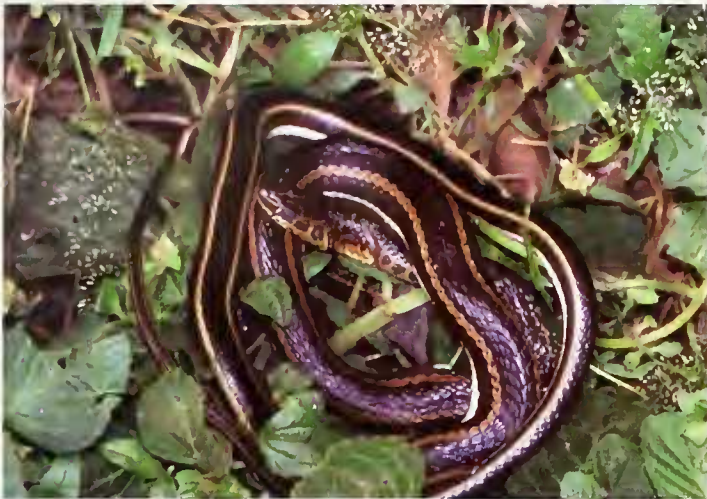
Fig. 16. Psammophis sudanensis from Bohicon, southern Benin.